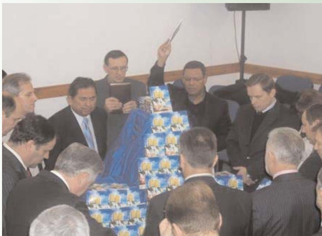
ESD - Annual Council