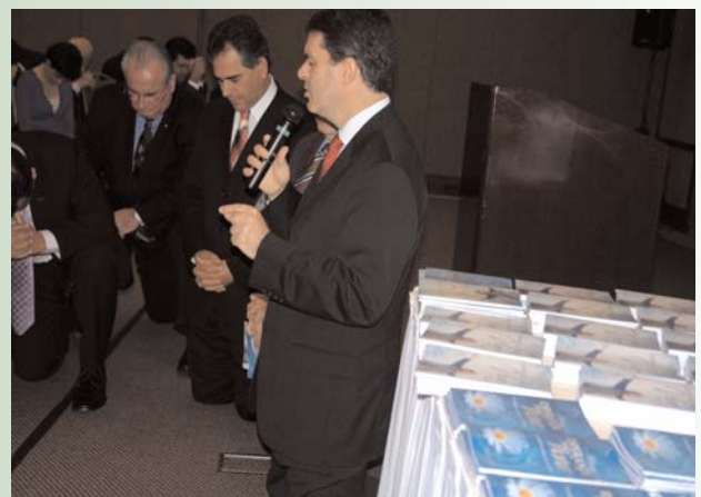
SAD - Annual Council