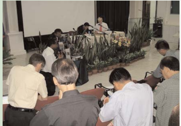
SSD - Annual Council