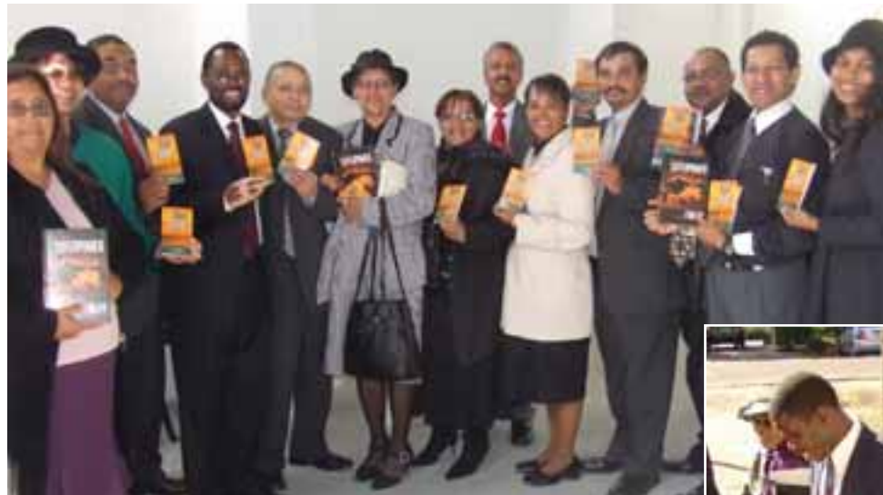
◀ Southern Africa Union church members prepare to distribute Steps to Christ after being challenged by the union Publishing Ministries Department.