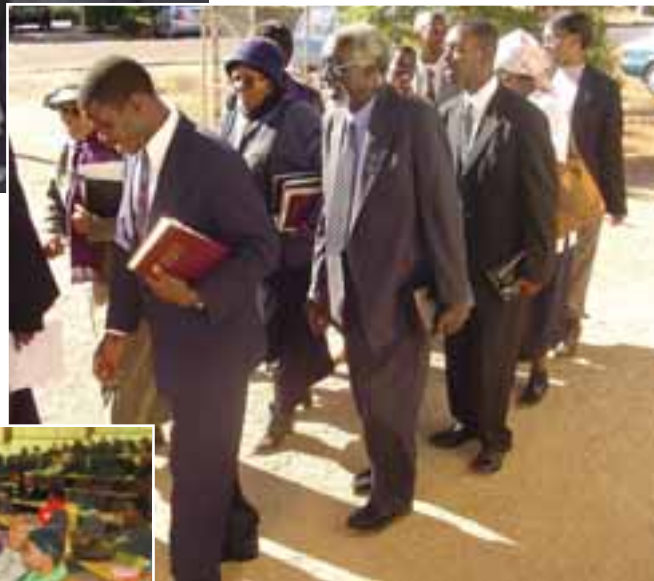
▲ LEs march with energy and enthusiasm at a weekend rally in the Botswana Union.